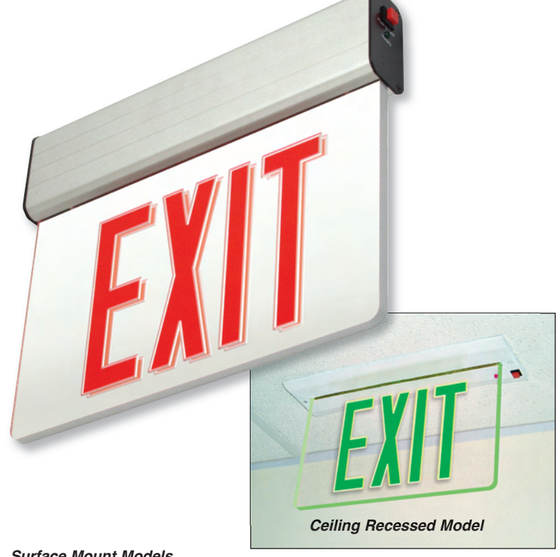
Surface Mount Models