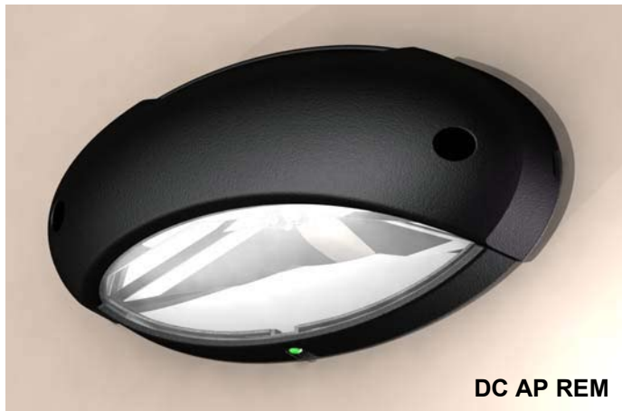
DC AP REM