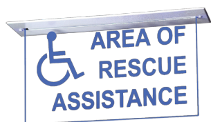
SPECIAL RECESSED MOUNT