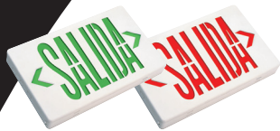
SALIDA faceplates also available.

Optional self-diagnostic/self-test feature offers the ultimate in worry-free maintenance and reliability.