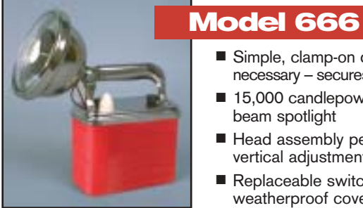
Shown with battery (not included)