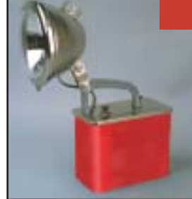
Shown with battery (not included)