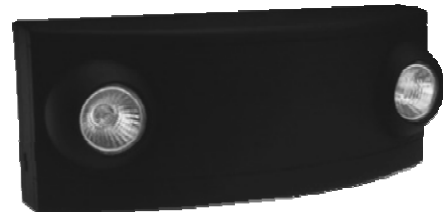
Optional black finish