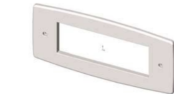
FL Full Opal Lens