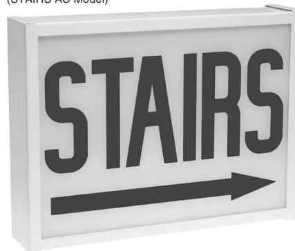
(STAIRS AC Model)

Battery: 1 year full, 5 years pro-rata (6 years total)