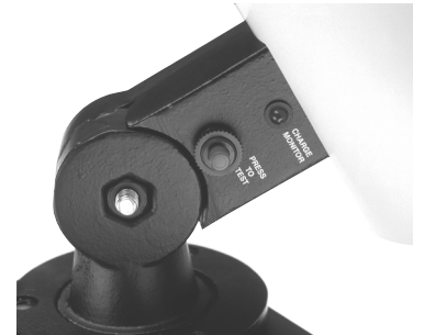
Pilot light and test switch detail