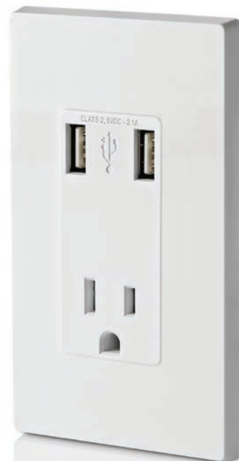
Cat. No. T5630 Shown with screwless wallplate 80301 sold separately