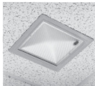
Fully-recessed Lite 2 fixture