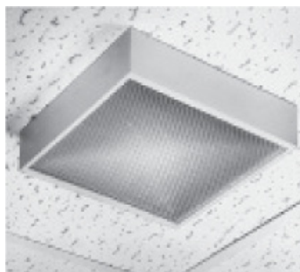
Semi-recessed Lite 2 fixture.

Single lamp models utilize a 9-watt miniature wedge-base lamp. Twin lamp models utilize two 7.2-watt miniature wedge-base lamps. The usual design objective in emergency lighting is to provide a level of illumination sufficient to allow people to leave a building in the event of a power failure.