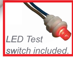
LED Test switch included.