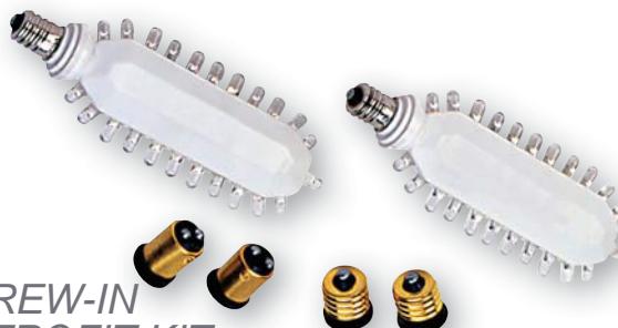
SCREW-IN RETROFIT KIT