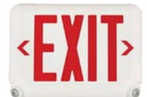
EVC Combo Exit/ Light