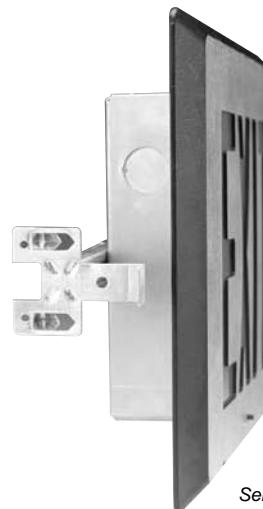
Sempra Exit shown attached to recessed back box assembly.

Sign Dimensions to be 9 1/2" (24 cm) high x 12 3/8" (31.4 cm) wide by 5/8" (1.6 cm) deep.