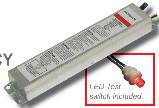
LED Test switch included.