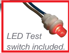
LED Test switch included.