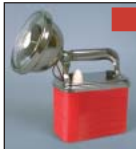
Shown with battery (not included)