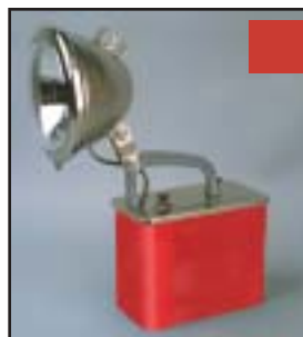
Shown with battery (not included)