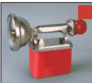
Shown with battery (not included)