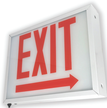
CHL / ECHL