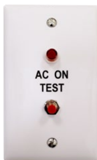
CRTS - Remote Test Switch