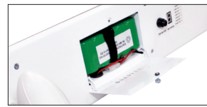
Tool-less hinged door for easy and safe access to isolated low voltage battery compartment.