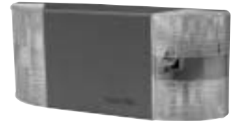
Models available in black finish