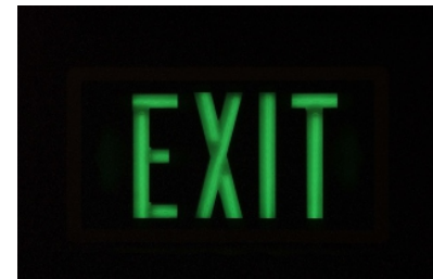
Sign shown in a darkened room