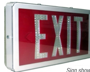
Sign shown with VS option