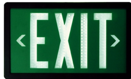
Sign shown in a lighted room