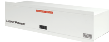
Recessed Ceiling Mount T-Grid Model