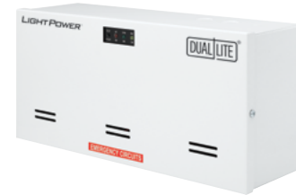
Surface Mount Model