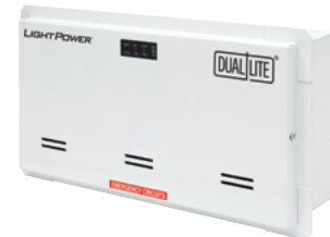
Recessed Wall Mount Model