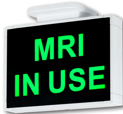
Surface Mount Model