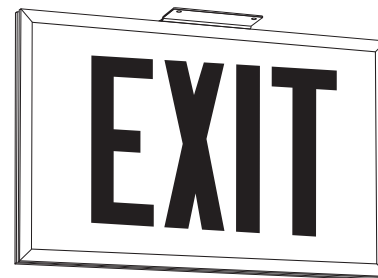
Aluminum Framing System Ceiling Mount