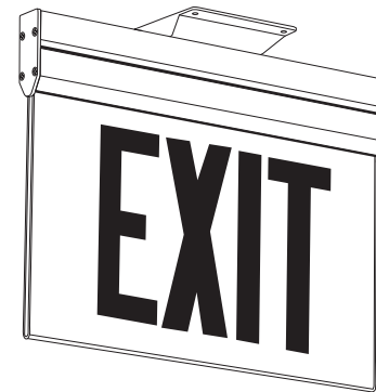
Acrylic Framing System Ceiling Mount