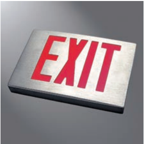
RXD - EXIT SIGN