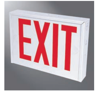
RXS - STEEL EXIT SIGNS

COMPLIANCES: UL924 Listed; Damp Location, NYC Code Compliant