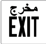
SW65 (Makhraj Arabic)