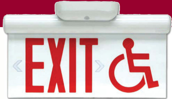
Meets the requirements of the State of Massachusetts

Contemporary styling and the rounded housing provide a distinctive architectural look. Quality construction includes a pure white extruded housing with a high grade clear acrylic legend. The Telesis features a unique die cast aluminum universal mounting canopy which allows for wall or surface ceiling mounting.