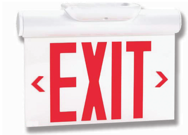
matching 6" exit sign available