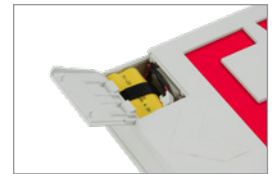
Tool-less hinged door for easy and safe access to isolated low voltage battery compartment. Only available with G2-NI option.