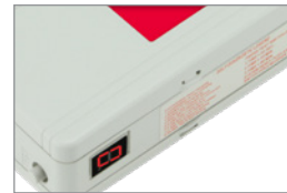
Numeric Indicator for dependable visual status and fault detection. Only available with G2-NI option.

Illumination: Long-life, high-intensity, red or green LEDs Housing: Rugged, injection-molded UL 94 5VA flame-retardant, high-temperature thermoplastic housing Input: 120/277VAC dual primary, 60Hz Battery: Maintenance-free NiCad battery Run Time: UL Listed 90 minute emergency run time, 24 hour recharge time Legend: Fully-illuminated 6" characters with 3/4" stroke and field-selectable directional chevrons Mounting: Ceiling, end or wall mounted, canopy included Finishes: Black or White Options: 2CI = 2 Circuit Input 220 = 220VAC, 50Hz Input G2 = Self-test/Self-diagnostics G2-NI = Self-test/Self-diagnostics with Numeric Indicator and Battery Access Door USA = Meets Buy America Requirements Certifications: UL Listed for Damp Locations and meets or exceeds the following: NEC requirements and NFPA 101. California Energy Commission (CEC) compliant Warranty: Any component that fails due to a manufacturing defect is guaranteed for five years with a separate five year prorated warranty on the battery. The warranty does not cover physical damage, abuse or instances of uncontrollable natural forces. See the full Exitronix warranty document for detailed information.