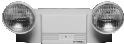
Shown with Halogen Lamps