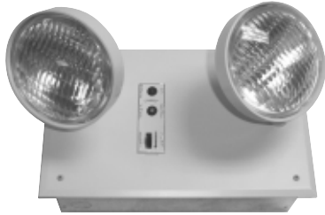
CEILING MOUNTED WITH ELF-645 DECORATIVE CYLINDERS.

Decorative Style Equipment 6 and 12 Volt Maintenance-Free Lead Calcium, Long-Life Lead or Nickel Cadmium Batteries