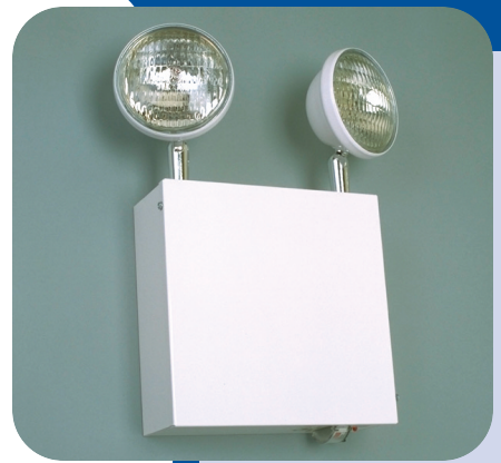
Shown in Optional White Finish